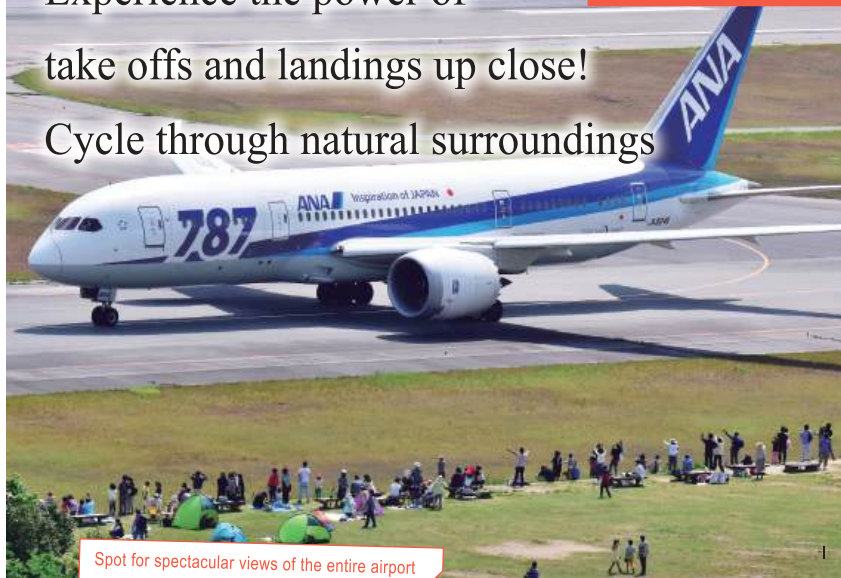
Spot for spectacular views of the entire airport

Experience the power of take offs and landings up close! Cycle through natural surroundings